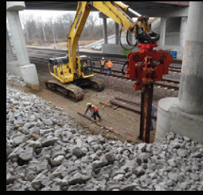
The versatile MKT Esc Models can be converted from the Excavator Mount configuration to the conventional free-hang.