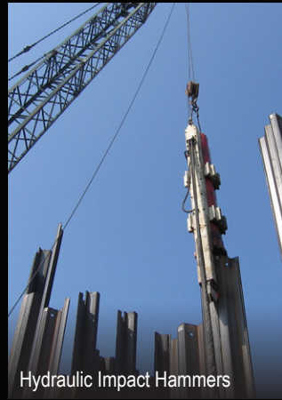
Hydraulic Impact Hammers

www.mve-stl.com | (314) 869-8600 1198 Pershall Rd, St. Louis, MO 63137